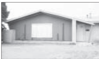
465 Lawrence No steps - one level. Furniture included