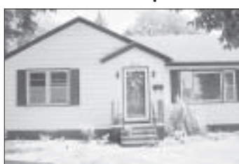
165 S. Franklin Great charm & seller wants offer.