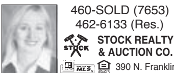
460-SOLD (7653) 462-6133 (Res.) STOCK REALTY & AUCTION CO. 390 N. Franklin

Stock R. Rock List 2x9 place 100% in GSN printed ad this a.m. to GSN