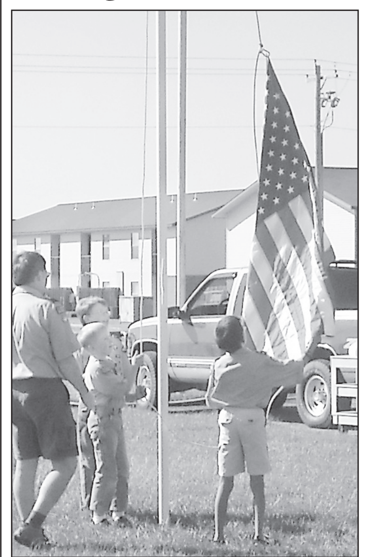
GARY SCHUETTE/Scout Troop 140