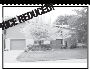
810 S. Garfield - $53,000