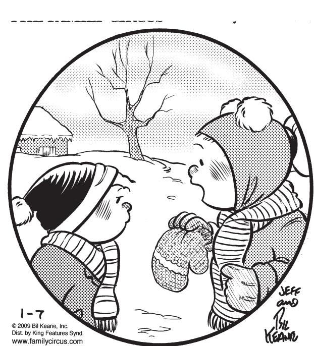
"Mittens are just gloves where they forgot to cut the fingers out."