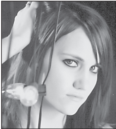
I plan on attending Washburn majoring in Nursing. Parents: Emily & Stan Strange