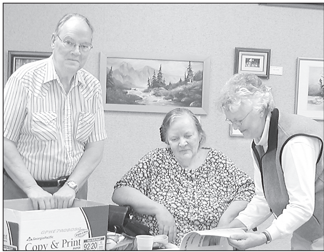
The Prairie Museum of Art and History houses many artifacts and art collections dealing with the western plains. It is operated by the Thomas County Historical Society as a non-profit

Prairie Life is an introductory exhibit which explores the settlement period of the high plains of Kansas from the 1880s to the 1930s.