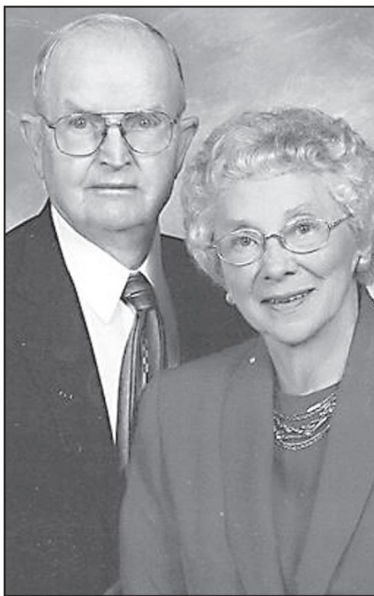
The Brewers in 2009