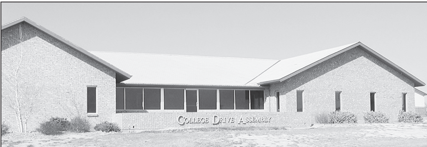
COLLEGE DRIVE ASSEMBLY OF GOD, 245 W. College Dr., Colby, Interim Pastor, Sunday School 9 a.m. for all ages, Adults: choice of Fireproof, Crown Financial, or the Bible Class. 462-8234. cdag@st-tel.net .

Worship in the church of your choice this weekend.