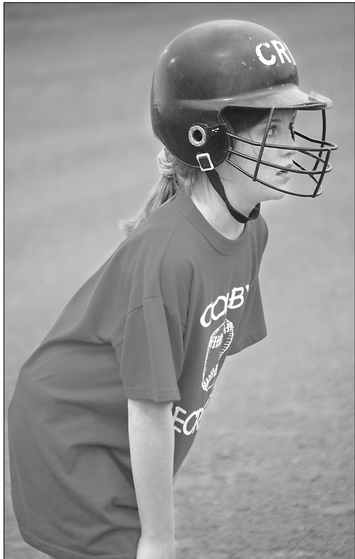
A young softball player wears a look of intensity on her face during a girls softball game on June 11 at the Colby Recreation Complex.