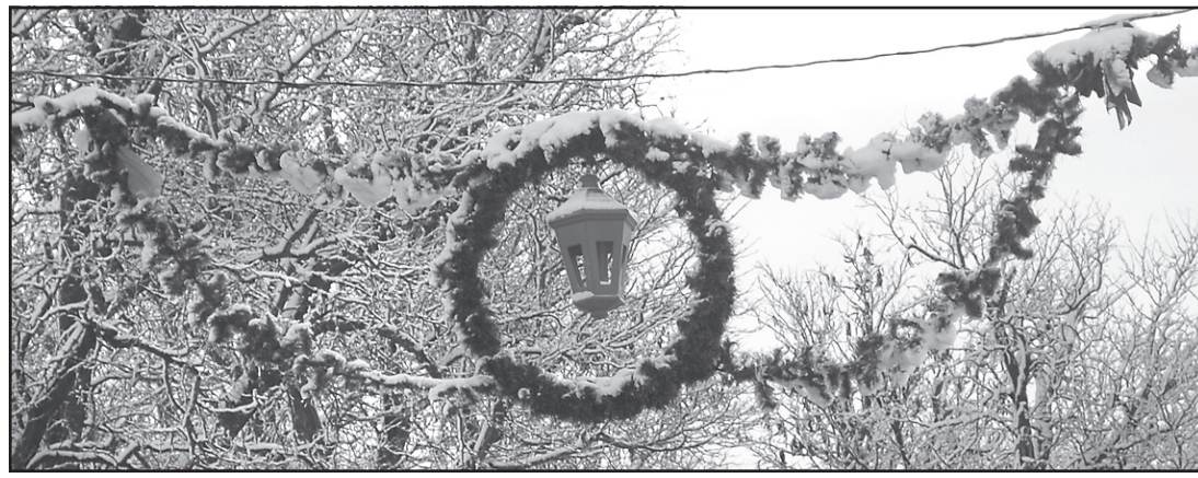
Sunday's snow decorated the city's Christmas decorations on Franklin Avenue. The storm passed through the area and moved on into eastern Kansas by morning.