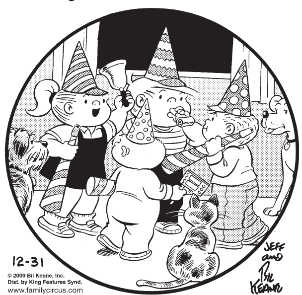
12-31 © 2009 Bil Keane, Inc. Dist. by King Features Synd. www.familycircus.com "Mommy says we get to have midnight at 9 o'clock!"