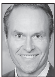
Robert Six • Attorney General

If the initial debt collection scam is unsuccessful, consumers have been re-contacted months later with the scammers posing as law enforcement officers or officers of the court. Typically, the consumer is threatened with ar-