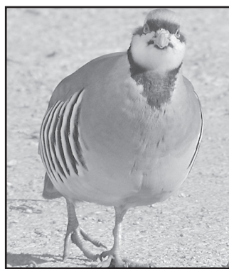
National Weather Service

Tonight: A 30 percent chance of showers and thunderstorms before midnight. Partly cloudy, with a low around 30. West wind between 5 and 10 mph.