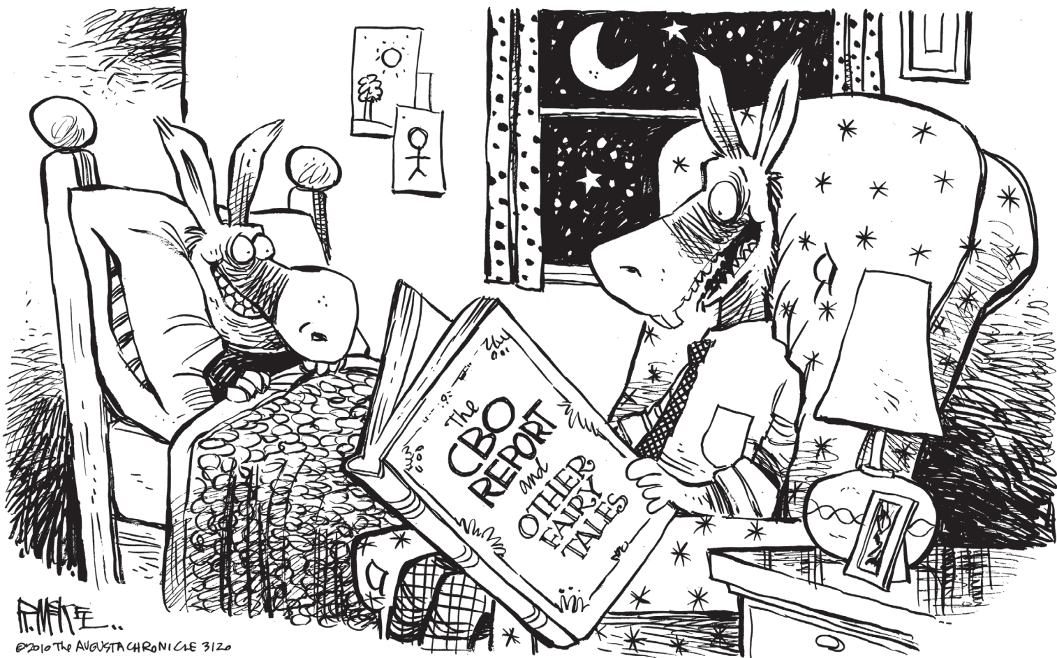
"...and the MASSIVE HEALTH CARE REFORM BILL ACTUALLY REDUCED the DEFICIT and THEY ALL LIVED HAPPILY EVER AFTER. The END."