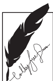
Free Press Letter Drop

U.S. Sens. Saxby Chambliss (R-Georgia), ranking member of the Senate Agriculture Committee, and Pat Roberts (R-Kansas), sent this letter to the President opposing budget cuts to farm programs in a tough economy: