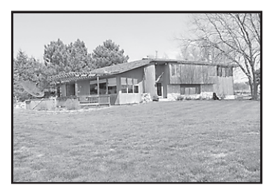
PHILLIPS COUNTY, KS 160 ac cropland & grass w/unique quad level home, 75'x48' steel bldg, 63'x36' steel barn w/pens & corrals- good water & fencing - great hunting - NE/4 of 23-4-9 - SW of Phillipsburg

105 ac Irrigated cropland, grass & improvements - SE of Trenton near Swanson Reservoir and beautiful, modern home, 2-car grg, large shop bldg, barn, other outbuildings, & second home for guest cottage or hunting lodge!