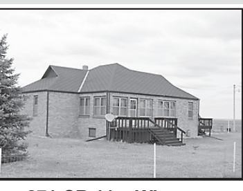
271 CR 11 - Winona Country brick home 4.5 ac - SW of Colby, KS -5 bedrooms, full basement, and good supporting outbuildings

ROOKS - 80 ac grassland, outstanding wildlife - E/2SW/4 of 27-10-20 - SE of Palco - NEW LISTING!