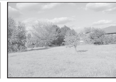
Building lot in established neighborhood CALL NAOMI FOR DETAILS!