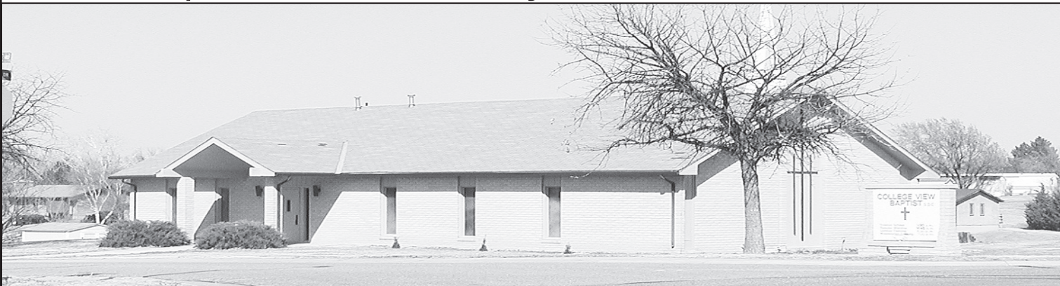
COLLEGE VIEW BAPTIST CHURCH (Affiliated with Southern Baptist), 1185 Wheatridge Rd. at College Drive, 785-460-7144, Sunday Bible Study 9:30 a.m., Sunday Worship services, 10:45 a.m. Prayer Service at 6:30 p.m. on Wednesday's.