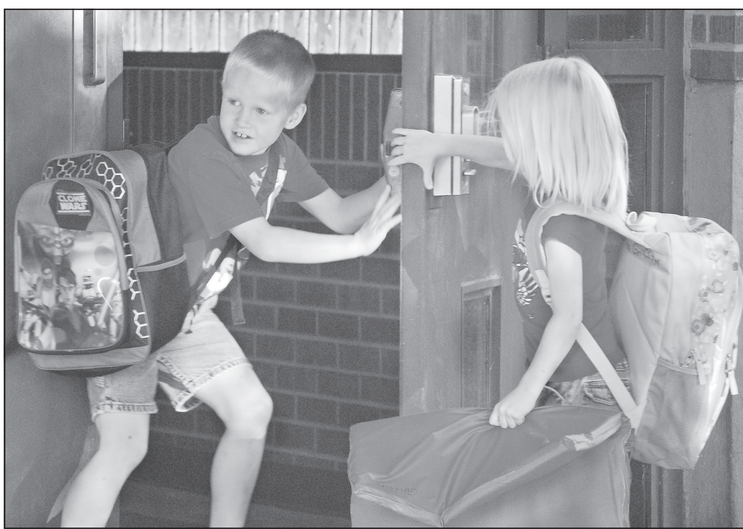
KEVIN BOTTRELL/Colby Free Press