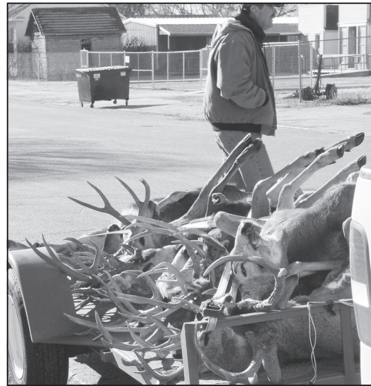
A dozen deer allegedly poached by a group from Wisconsin filled a trailer parked across from the post office in Oberlin on Wednesday.