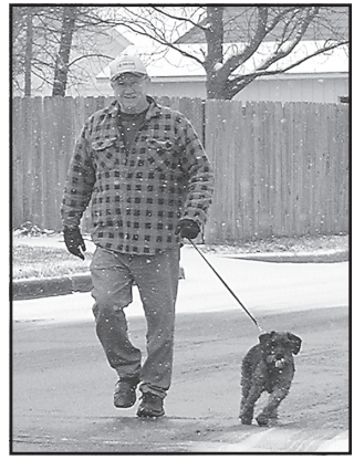
National Weather Service

Tonight: Snow and areas of blowing snow. Low around 7. Wind chill values as low as -11. Blustery, with a north wind around 20 mph, with gusts as high as 30 mph. Chance of precipitation is 90 percent. New snow accumulation of 2 to 4 inches possible.