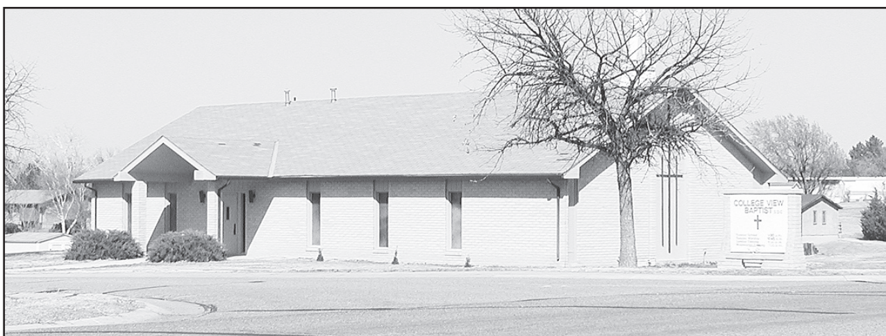
COLLEGE VIEW BAPTIST CHURCH (Affiliated with Southern Baptist), 1185 Wheatridge Rd. at College Drive, 785-460-7144, Sunday Bible Study 9:30 a.m., Sunday Worship services, 10:45 a.m. Prayer Service at 6:30 p.m. on Wednesday's.

Worship in the church of your choice this weekend.