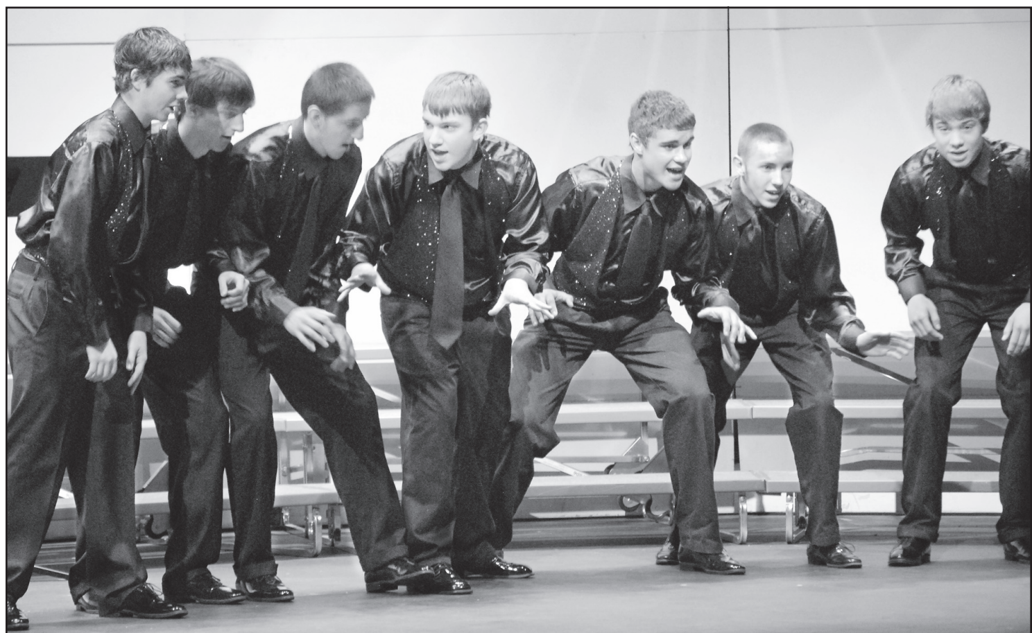
KEVIN BOTTRELL/Colby Free Press