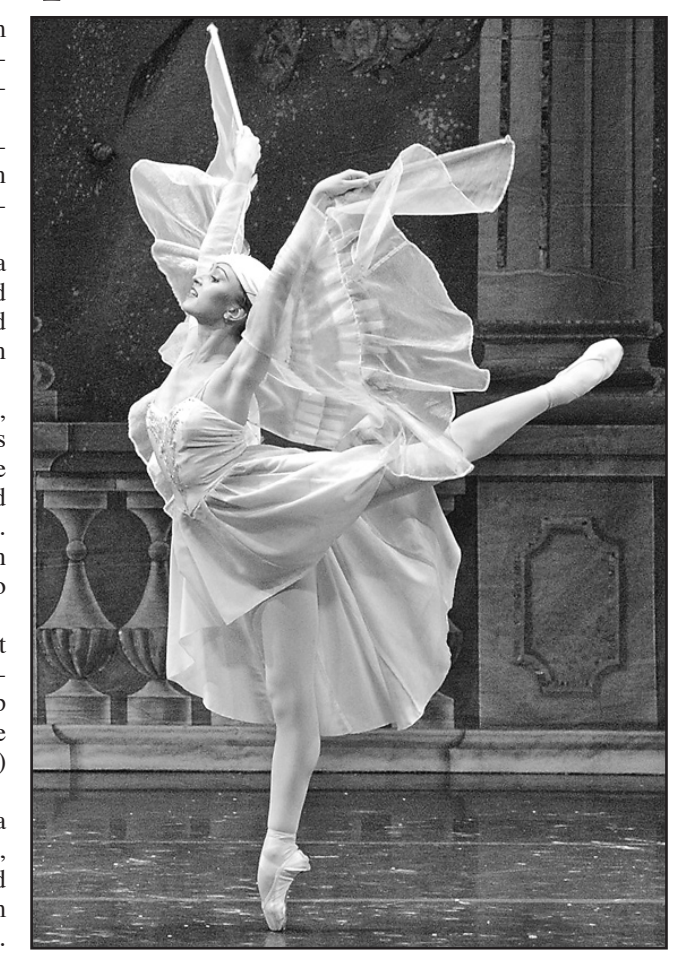
Moscow Ballet's Great Russian Nutcracker features the Dove of Peace.

The Nutcracker tells the beloved Christmas story of the girl who falls in love with a Nutcracker Prince. The Act I Christmas party enchants with its magical toys, evil Mouse King and a journey through the glittering Snow Forest. Unique to the