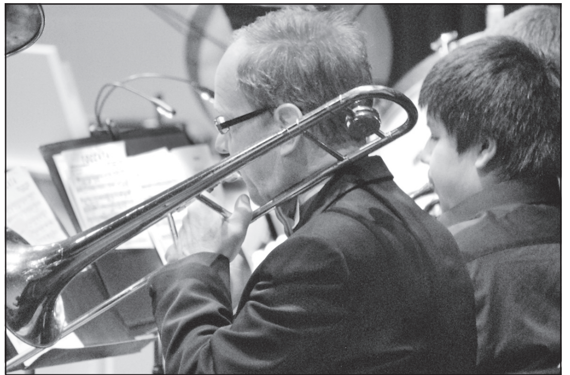
Adult and youth musicians alike joined forces in the Pride of the Prairie Orchestra's concert Thursday at Colby Community College. The orchestra features players from all around northwest Kansas, eastern Colorado and southwest Nebraska.