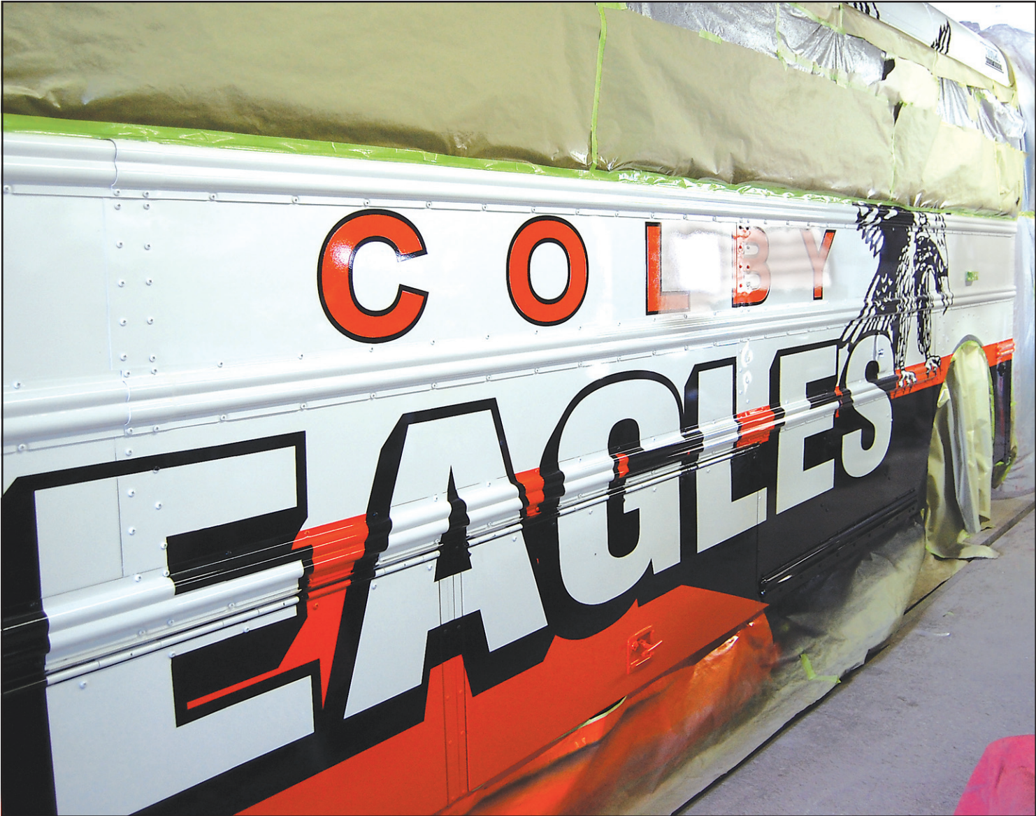
Vans Body and Frame was hard at work the past week and a half getting the new paint job ready on the Colby School District's new activity bus. The bus should be ready to go next week, in time to transport kids to a few activities even as the school year winds down.