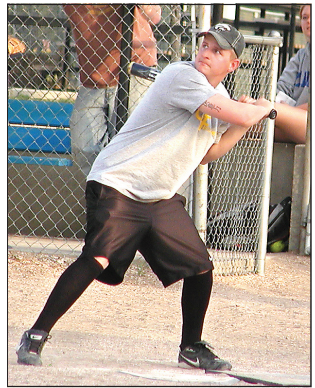
A player waited for a good pitch June 2 in a men's softball league game at the Colby Recreation Fields. The league has played games every Thursday night since May 26.

Home Run Derby Thursday, 6:15 p.m. on F4 $10 cash entry fee, winner gets cash prize. Provide your own pitcher.