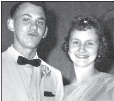
The Gifts in 1961

Guinness World Records says the heaviest newborn ever recorded weighed 23 pounds, 12 ounces, born to an Ohio woman in 1879.