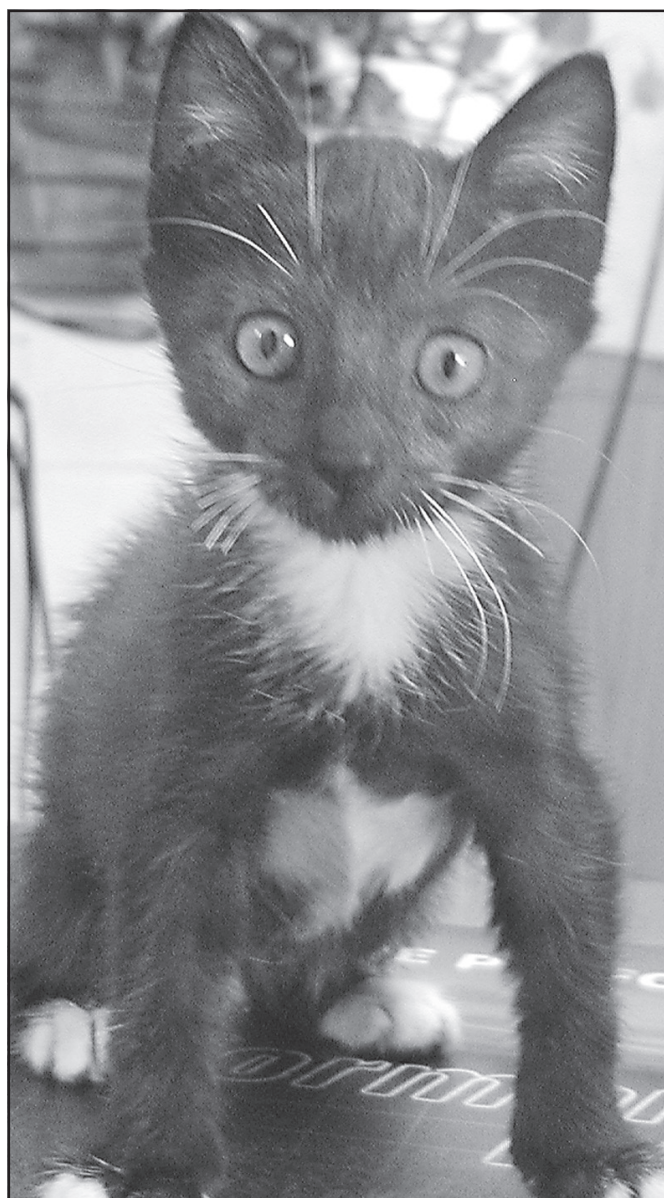
The Colby Animal Clinic has two female kittens available for adoption. This 6- to 7-week-old, black and white long hair is ready for a new home.