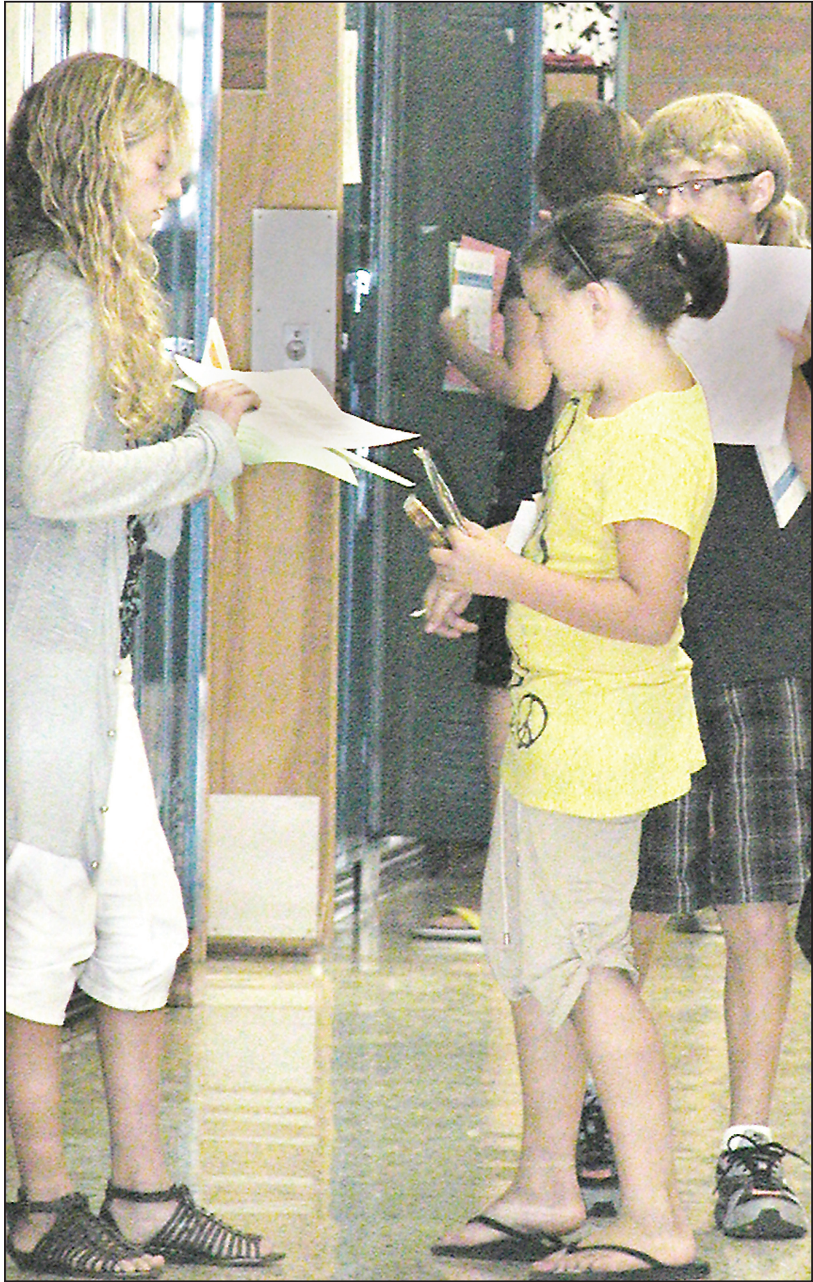
Incoming sixth graders at Colby Middle School went on a "scavenger hunt" this morning. The hunt helped the new middle schoolers learn where their classrooms are located.

Colby Community College began classes on Aug. 16.