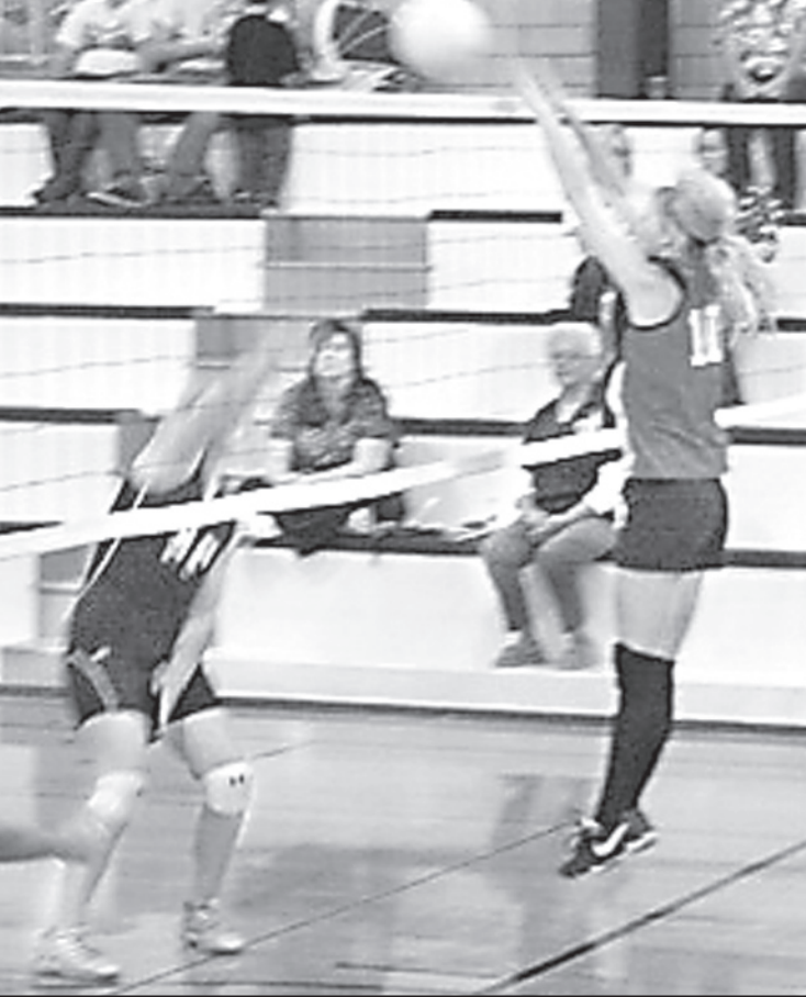
GOLDEN PLAINS HIGH SCHOOL YEARBOOK STAFF

Three days later, the girls traveled back to Cheylin for a dual match prior to the high school football game. For this match, they played to see who could win the best three out of five sets. Having played each other multiple times earlier this season, each team knew they were going to have to give it their all. The Lady Bulldogs lost the first set 19-25 and the second 17-25. An exciting third set was finally won with a close 31-29 score. Energized, the Lady 'Dogs won the fourth set with a 25-18 score, sending the dual into a fifth set where the girls failed to