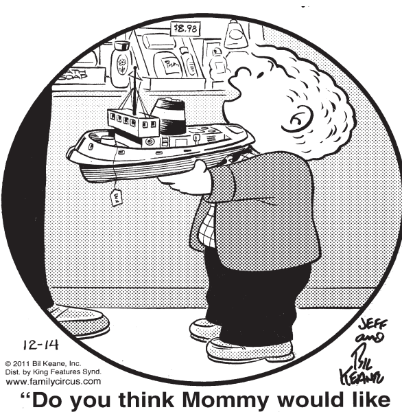
this for Christmas? She can use it in her bathtub.3