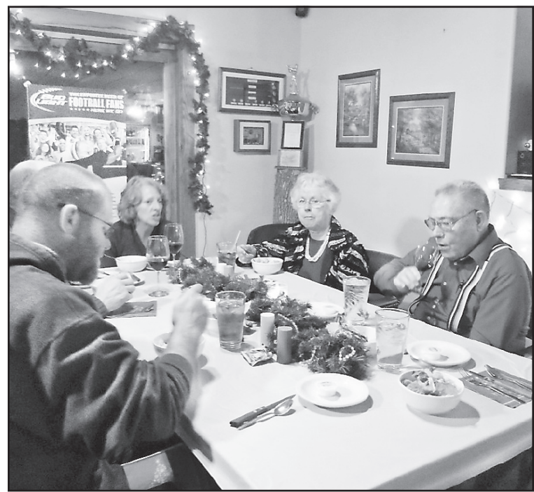
Lions Club Lions from Colby and Gem joined the Atwood Lions for their Christmas party Monday.

The Colby club's next meeting will be Monday, Jan. 9, at the Student Union.