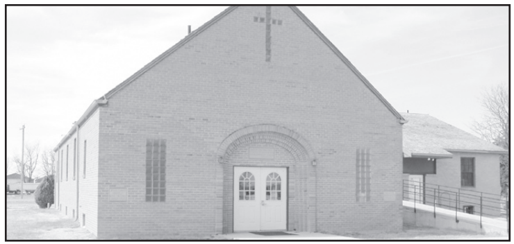
Mingo Bible Church