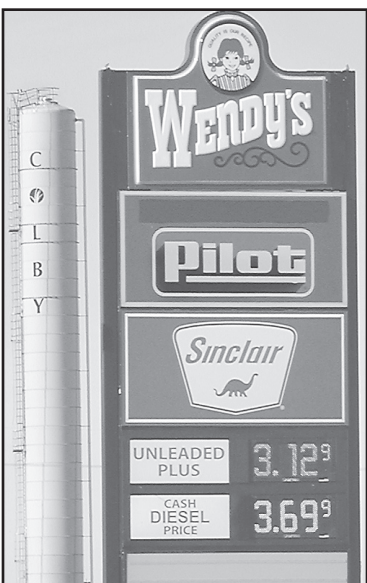
The Bosselman Travel Center in Colby changed its name and signs after being sold to Pilot Flying J on Thursday.