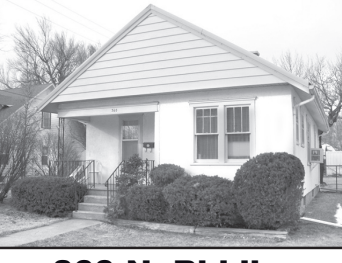
360 N. Riddle

Great Cottage 3 BR with lovely new look. Call Molly today!