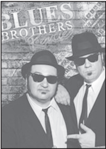
Blues Brothers Revue

The show is a faithful recreation of the characters and