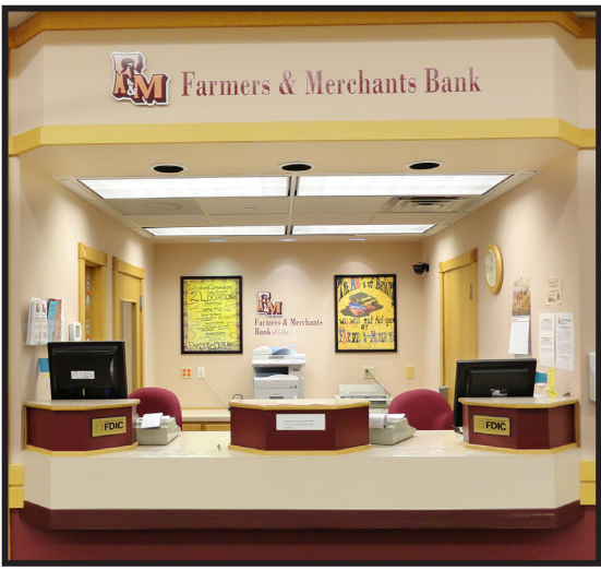
Photo: Dillons Bank Location