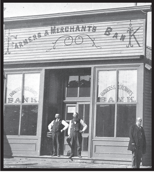
Location 360 N. Franklin