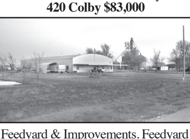
Feedyard & Improvements. Feedyard permit for 9000 head Scott County KS