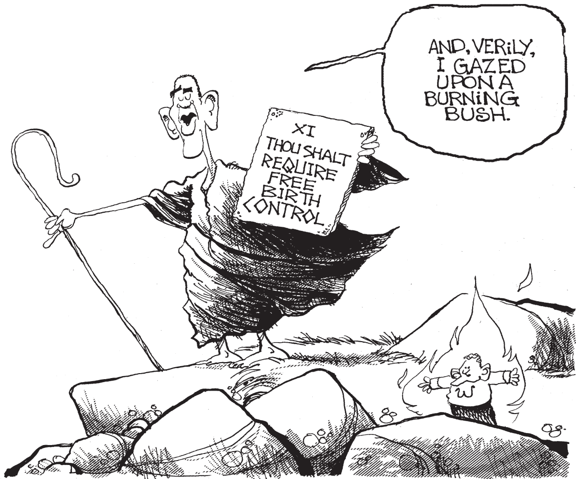
THE LOST COMMANDMENT

©2012 MRC.org/CMI Dist. by King Features