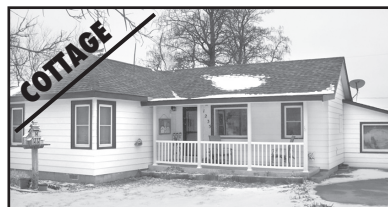
SO ATTRACTIVE 2-3 BR, 2 bath 1235 W. 6th $79,500