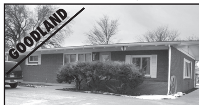
Brick 4 BR Home, Large Shop/grg 704 Arcade, Goodland