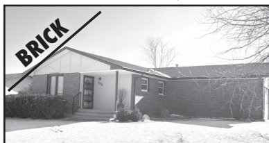
So Many Extras 4 BR, 2 bath 1310 E. 8th $165,000