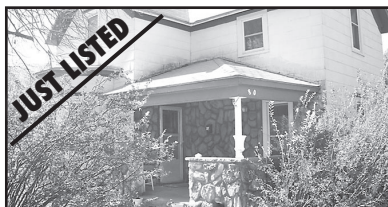
"Just Listed" New Look - Must See 820 W. 4th $97,500

Stock Realty & Auction Co. 390 N. Franklin Ste. 100 Colby, KS 67701 www.stockra.com (785) 460-7653