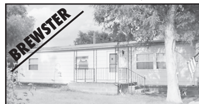
Attractive 3 BR Home, Spacious FM Room 309 Rock Island