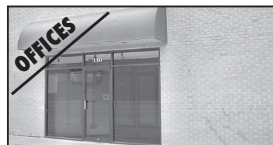
Beautiful Office, lots of space & storage 140 W. 4th, Colby