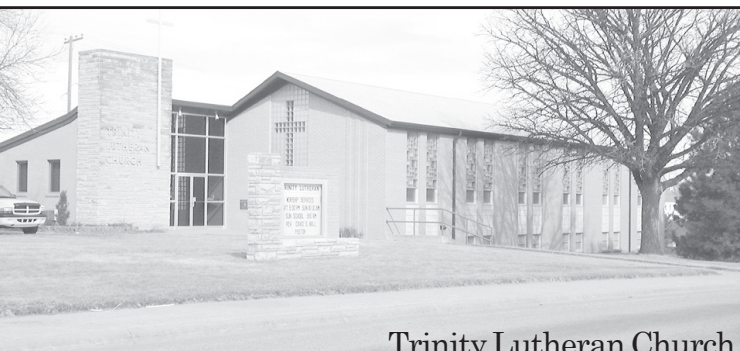
Trinity Lutheran Church