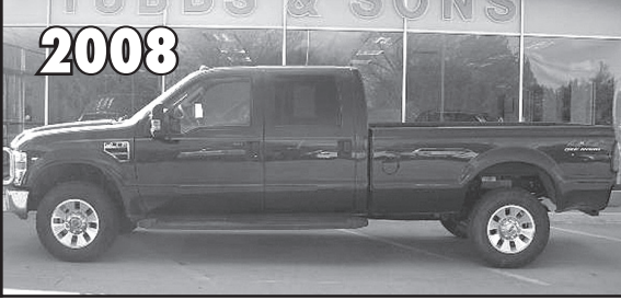
2008 Ford F350 Heavy Duty Crew Cab Lariat Long Bed, Dark Blue w/Tan Leather, Diesel 4wd, Hydaball, Grill Guard, Bed Liner, Trailer Tow $28,850.00