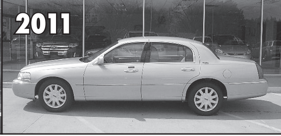
2011 Lincoln Town Car Signature Limited, Light Blue w/Tan Leather $33,500.00