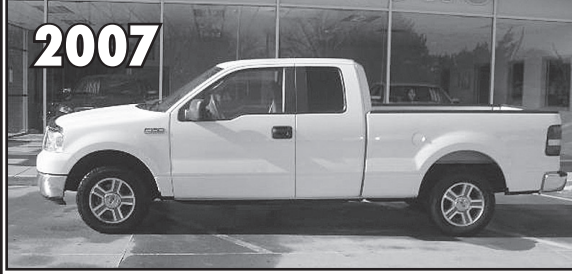
2007 Ford F150 Supercab XLT 4x2, White w/Gray Cloth, V-8, Trailer Tow, Local One Owner, 84K Miles $14,850.00