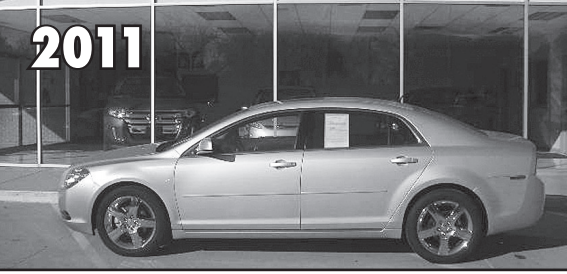
2011 Chevrolet Malibu LT, Silver w/Black Leather, Sunroof, Chrome Wheels, V-6 Auto, Heated Seats, XM Radio, 10K Miles $21,000.00