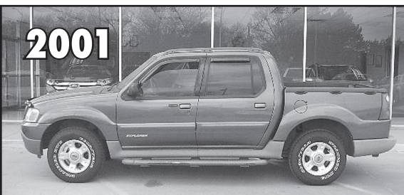
2001 Ford Explorer 4x4 Sport Trac, Green w/Tan Leather, Power Moonroof Just Arrived