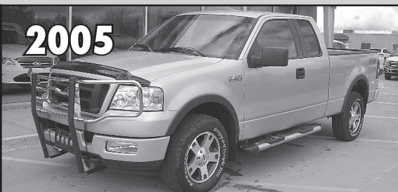
2005 Ford F150 FX4 Super Cab, Silver w/Gray Cloth, 4x4, Captain Chairs, V-8, Local Trade Just Arrived