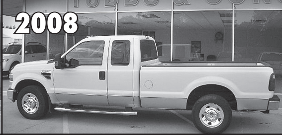
2008 Ford F250 Heavy Duty Super Cab XLT, White w/Gray Cloth, One Owner, 30K Miles $20,995.00