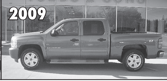
2009 Chevrolet Crewcab LT 4WD, Blue w/Black Cloth, Trailer Tow, Local One Owner, 11K Miles $28,500.00