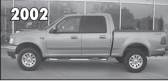
2002 Ford F150 Supercrew XLT, Pueblo Gold w/Tan Cloth, V-8, Trailer Tow $10,850.00