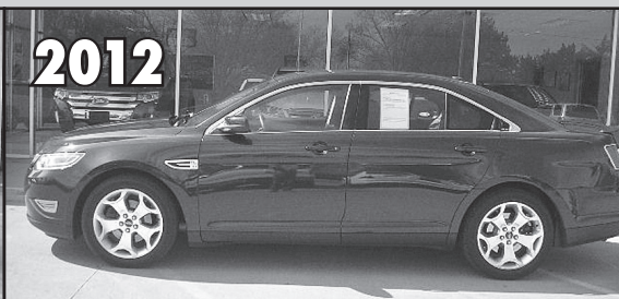
2012 Ford Taurus SHO AWD, Dark Blue w/Charcoal Leather, Heated/Cooled Seats, Power Moonroof, Sony Sound System, Ecoboost Engine $36,500.00