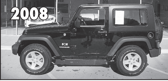
2008 Jeep Wrangler, V-6 Auto., Black Hardtop w/ Gray Cloth, 9K Miles $21,995.00