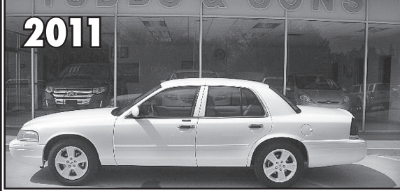
2011 Ford Crown Victoria LX, White w/Tan Leather, Chrome Wheels, 15K Miles $19,500.00