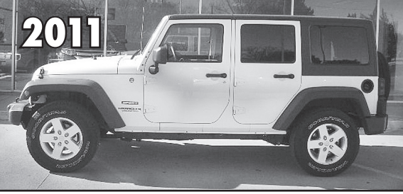
2011 Jeep Wrangler Unlimited, White w/Black Cloth, Removable Hard Top, V-6 Engine, 6 Speed Automatic $28,850.00