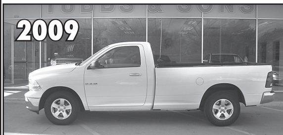
2009 Dodge Ram 1500 SLT Regular Cab 4x2, White w/Charcoal Black Cloth Split Seat, 4.7L EFI V-8 Automatic Transmission, Full Power, 59K Miles $13,850.00