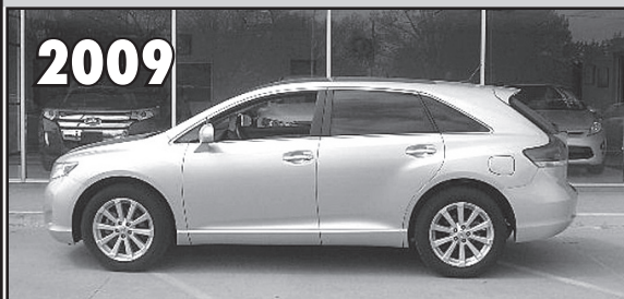
2009 Toyota Venza FWD, Silver w/Cashmere Leather, Double Roof, Local Trade. $23,850.00

810 S. Range, Colby, KS • tubbsford.com 785-460-6746 • 800.369.3673