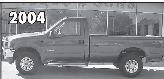
2004 Ford F250 Heavy Duty Regular Cab XLT 4x4, Diesel, Trailer Tow, Hydaball, 125K Miles $13,850.00