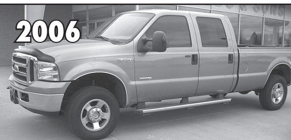
2006 Ford F250 Crew Cab Lariat Diesel, Tan w/Tan Leather, Bedliner, Heated Seats, 8 Foot Bed, Trailer Tow, 28K miles, Clean Truck! $29,850.00