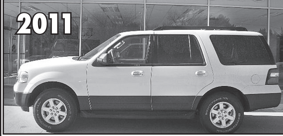
2011 Ford Expedition XLT 4WD, White w/Tan Cloth, Trailer Tow, Only 9,500 Miles! $34,500.00