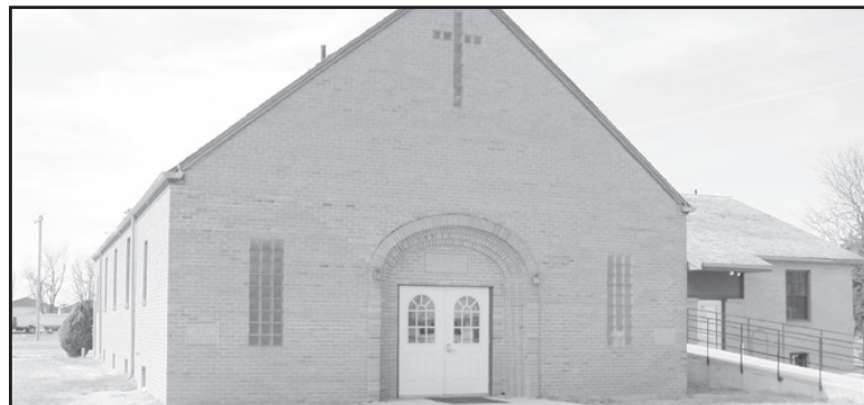
Mingo Bible Church