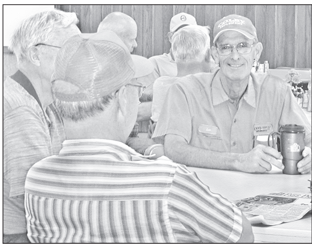
Even between activities, the Senior Progress Center is a popular place to gather with friends, as seen with this group visiting together this morning.