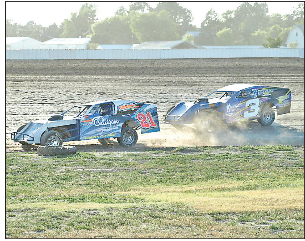
THOMAS COUNTY SPEEDWAY

Races will be held at the speedway at 7 p.m. on Sunday. Promot-