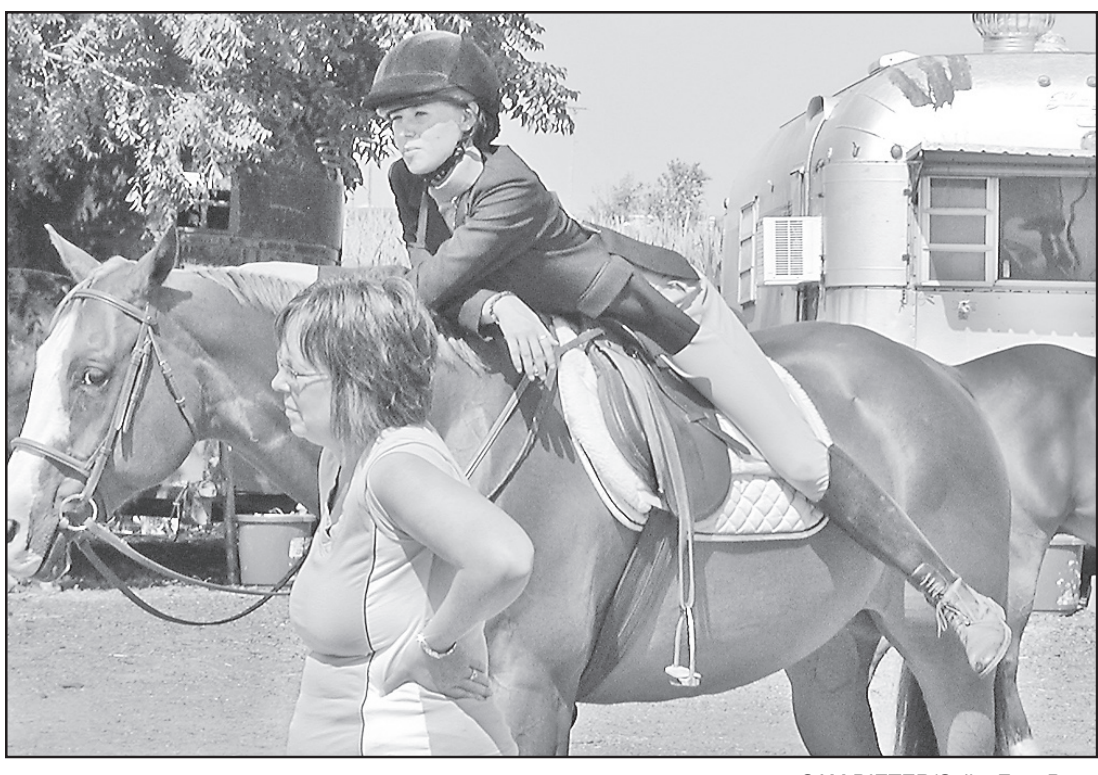
A young rider relaxed on her horse watching others ride in the English Equitation part of the 4-H horse show, at about 11 a.m. on Monday morning at the small arena on the Thomas County Fairgrounds. The horse show is part of the Thomas County Free Fair.