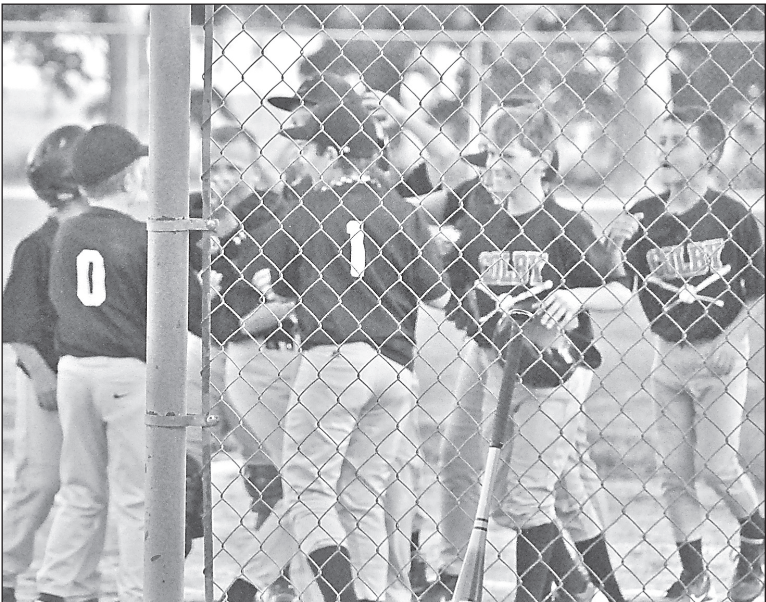
The 12 and Under Baseball boys congratulated each other after a win this season. The team came in first place in the West divi-