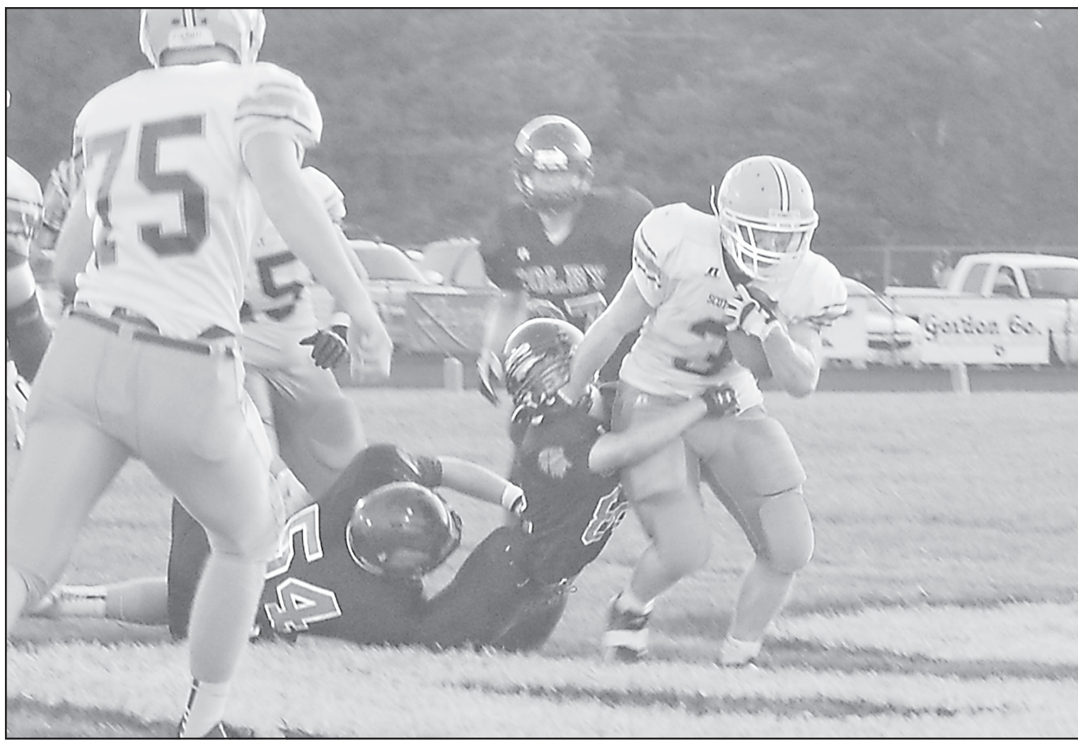
Colby High defenders tried to bring down a Scott City running back Friday during the varsity football game at Dennen Field.