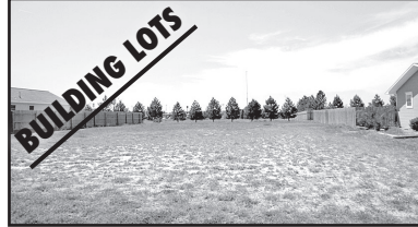
We have Several Residential Building Lots Call Molly 462-5203