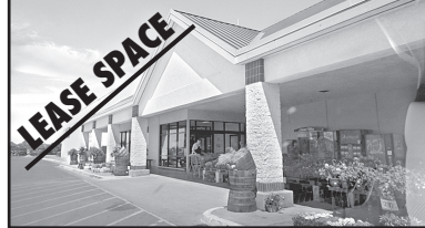
Lease Space Available. Located in Colby Dillons Store Call Molly for Details