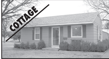
Cute 2 BR Cottage Corner Lot 685 N. Sterling $46,000