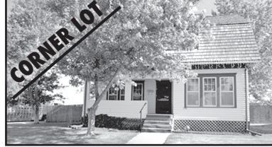
Huge Fenced Corner Lot! 3 BR, 2 Bath Home 210 W. 5th $92,500