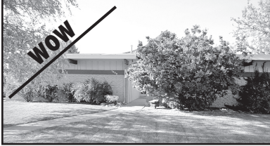
Great Family Home, 6 BRS, 3 Bths - Plus 1809 Harvey Ct. $159,900