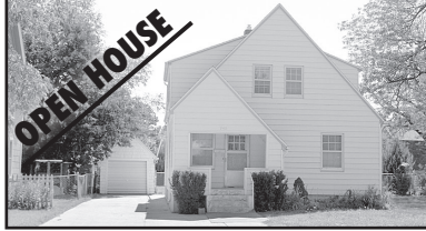
OPEN HOUSE Sunday, Sept. 30, 1-2 p.m. 940 W. 2nd