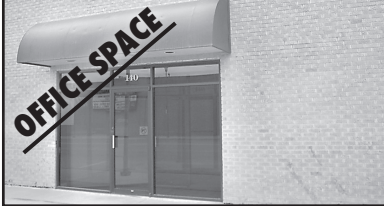
Great Office Building Fantastic Location Purchase or Lease!!