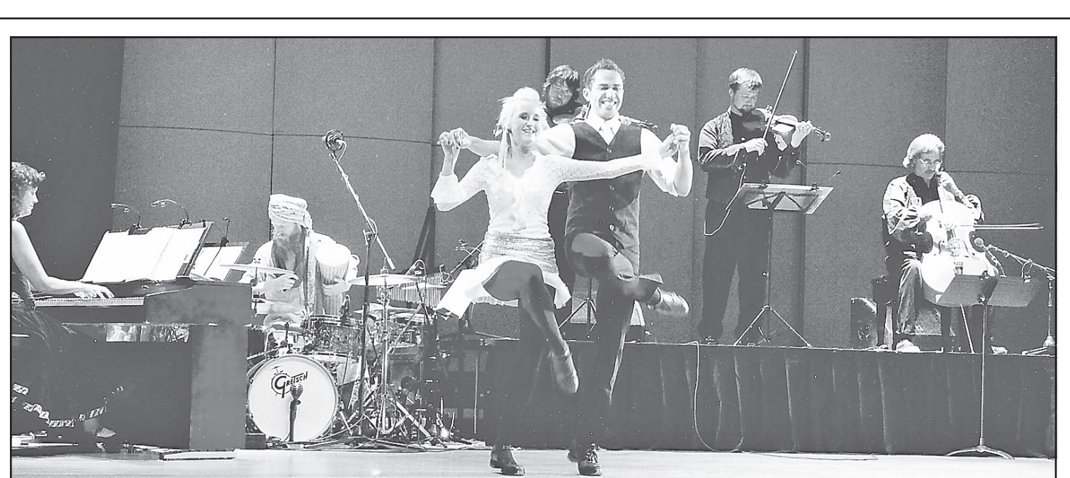
Feast Celtic Music will appear at 3 p.m. Sunday at the Oakley High School auditorium, sponsored by Western Plains Arts.

For information on the Tobacco Use Prevention Program, go to www.kdheks.gov/tobacco. Information about the Smokeout can be found at www. greatamericansmokeout.org.