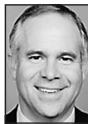
U.S. Rep. Tim Huelskamp ● Capitol Notes

Chief among my responsibilities as a member of the House Veterans' Affairs Committee is oversight of the Department of Veterans Affairs. In the 22 months I have been in Congress, I have heard horror story after horror story about the conditions our veterans face while pursuing the health care and resources they are due. Obviously, poor conditions at our hospitals are an affront to our veterans, but also to the nation's taxpayers. We are working