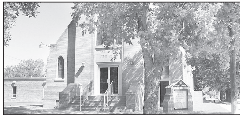
First Baptist Church